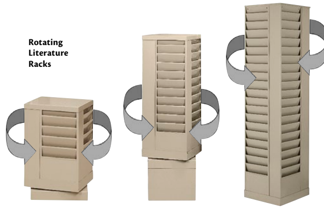
Rotating Literature Racks